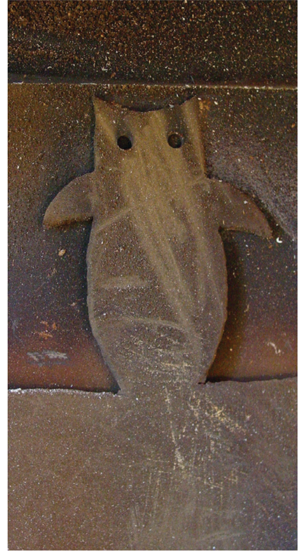
chimney, wood stove and owls