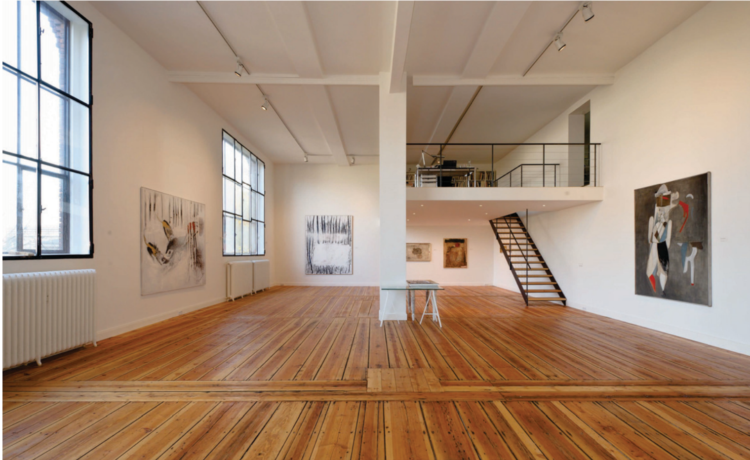
platform and stairs