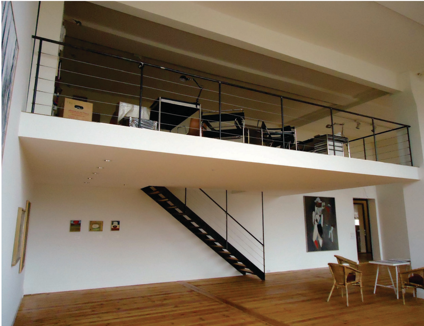
stairs and railings